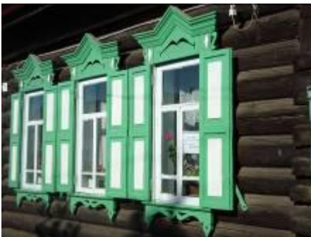
House on Lake Baikal

This newsletter is four pages long so sit down, pour yourself a wee dram and start planning.