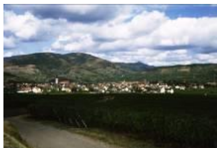
Walking or cycling in Alsace

This walk can be also called "the Balcony of the medieval Alsace", a balcony on which we are the spectators of the landscapes and its beautiful views. There is plenty of time to taste some world famous Riesling in between visiting 12th century buildings.