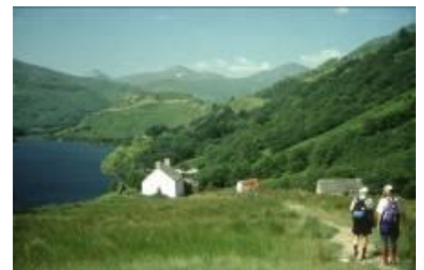
West Highland Way

Price is US$3290 per person and US$3000 for non-riders. This is based upon a group of 7 to 10 people. Airfares to and from Kathmandu are not included and would be about $1500 including tax.