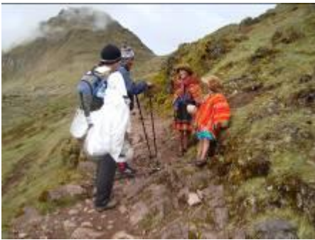
On the Lares Trek in Peru

The quality of overnight mountain huts is exceptional as is the nightly cuisine, ensuring you experience traditional Swiss alpine hospitality at its best.