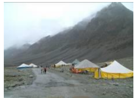
Cycling from Leh to Manali

I have a number of excellent photos which you can buy from me if you need to illustrate anything. Most are travel related and I have a few with some humorous signs or situations (see below).