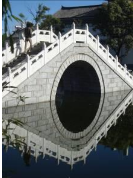
Near Dali in China

Start your bicycle tour in Salzburg with the panorama of the Alps at your back, cycling through the spectacular Salzkammergut, to the great European city of Linz. Then up into the hills to medieval Cesky Krumlov. From there it's on to Prague, city of a thousand spires.