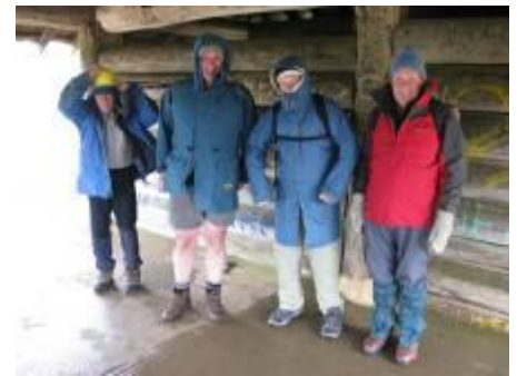
Ready for a bush walk in Victoria!

Nestling in the very heart of Glencoe, amongst the spectacular and majestic mountains of the Scottish Highlands, Clachaig Inn has been a source of accommodation and hospitality for travellers for over three hundred years. The hotel has 23 fully modernised bedrooms with en suite facilities with many enjoying magnificent views of the Glencoe mountains