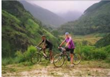
Easy cycling in Sri Lanka