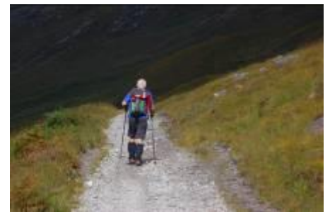
Walking the WHW

Travel to Peru on this family adventure and uncover the terraced ruins of Peru's mystical ancient city. Explore some of South America's most beautiful architecture in Lima before flying to Cuzco, and journeying on to the cultural highlights of the Sacred Valley. Acclimatise in Chinchero and enjoy a local homestay, then warm up for the Inca Trail trek with a mountain bike adventure in the Andean countryside. Rest up and recharge in the ancient town of Ollantaytambo before embarking on the iconic Inca Trail to the ruined Inca city of Machu Picchu. This 14-day tour encapsulates Peruvian culture and lets you in on the secrets of their ancient civilisation.