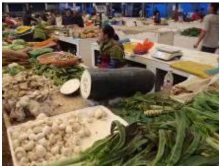
Look at the size of the cucumber!

The flat cycle ways and pretty canals of Holland offer some of the most enchanting and safe cycling opportunities in Europe. Aboard your hotel barge and in the company of other families, visit castles as you cycle through the Dutch riverlands. During the day there is plenty of opportunity to visit interesting towns such as the famous cheese town of Gouda, take advantage of local family friendly attractions such as Dutch golf and view the 19 windmills of Kinderdijk. Specially designed for kids from 7 to 11 years old, the pace is relaxed ensuring that all members of the family are able to fully participate in the days cycle.