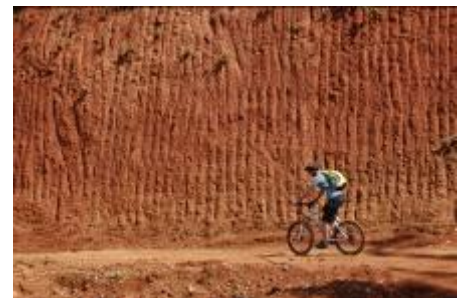
Off road in Nepal

The ultimate US road trip, by bike! From San Francisco to Los Angeles, our journey covers the very best of California. This truly iconic ride takes you through the rolling hills of world renowned wine estates in Napa Valley, alongside towering Redwood trees and across the Golden Gate Bridge to mark our arrival into glittering San Francisco.