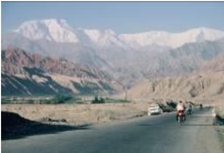
Cycling on the KKH in China

Widely recognised as one of the most beautiful places in the world, Cape Town and its surrounding countryside and beaches provide a stunning backdrop for this tour. Our unique circular route allows us to take in many of the fantastic sights that the Cape Peninsula has to offer. In addition to Table Mountain and the chance to sample the produce of the world famous wine estates of Stellenbosch, the wild coastline and rugged interior provide some classic riding on peaceful roads with very little traffic.