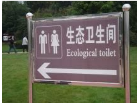
Toilet near Kunming

From the prestigious Loire River and its Royal châteaux, hiking via the green Sologne forest, to the famous Touraine Vineyards. You will enjoy the richness of the Loire Valley area: a rich artistic and historical heritage combined to incomparable flavours!